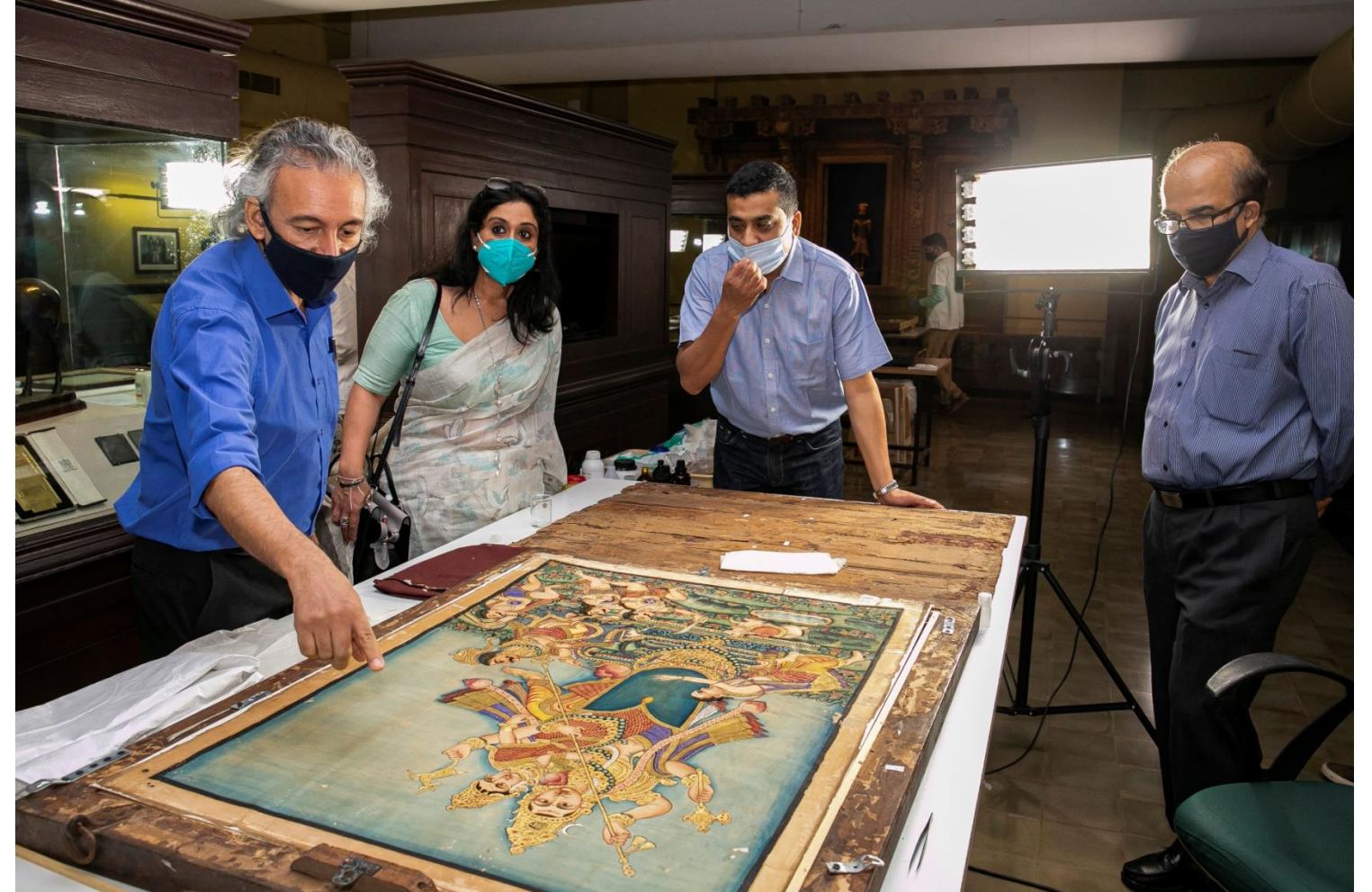
Monitoring of project activities by Citi India officials continued online and with physical visits as soon as restrictions were lifted.